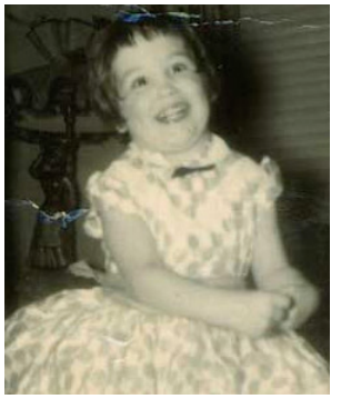
Geri Age 2